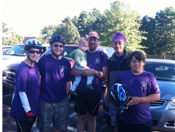
Fundraising for MS, Mays Landing, NJ 2014