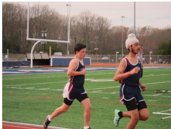
Doing the mile at a High School meet