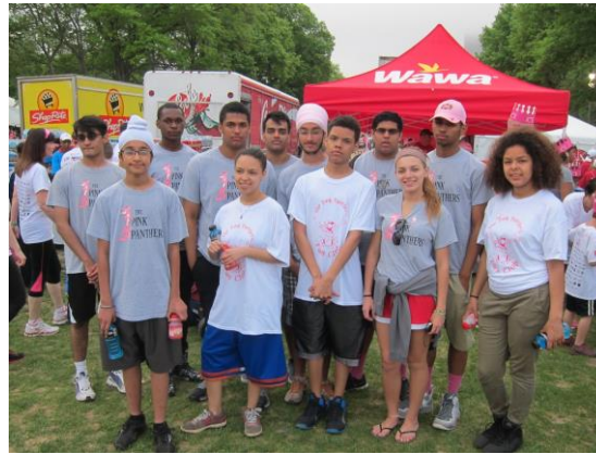
Co-leading the Pink Panther Breast Cancer team in Philadelphia, May 2015